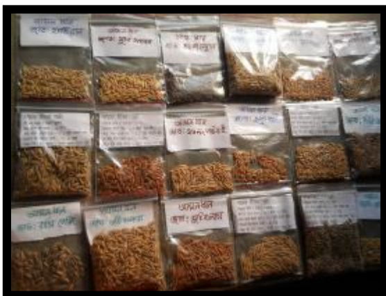
Picture -1 Local paddy seed