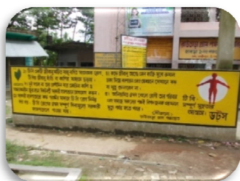
2. Wall writing at Rautara GP.