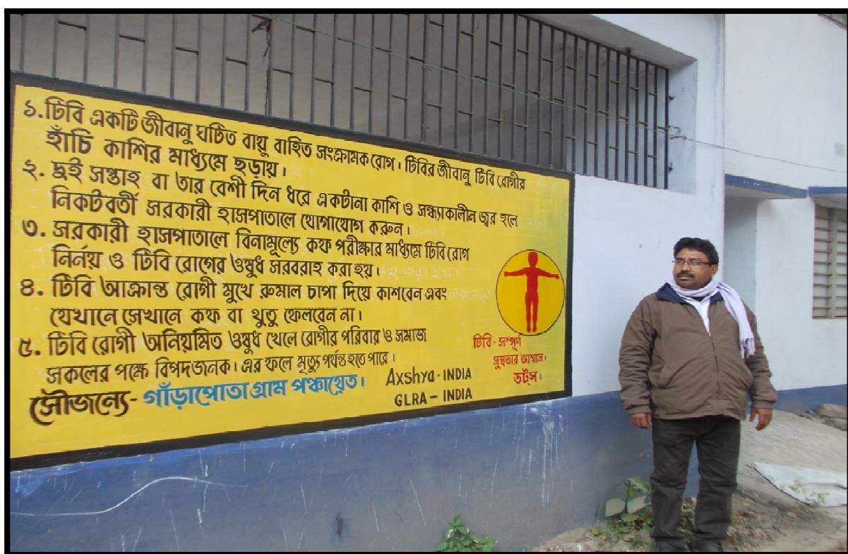
Wall writing initiatives by Garapota GP at Bongaon TU impact by GKS Meeting.