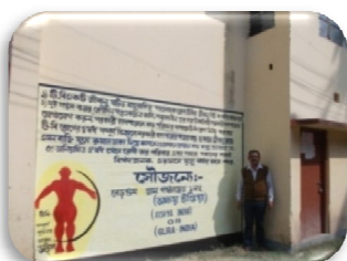
1. Wall writing at Bergoom No. 1 GP.

Some wall writing pictures are displaced here.