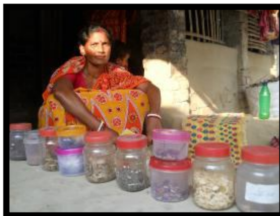
Picture -2 Seed store by women group member