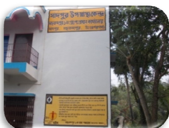
3. Wall writing at Maslandapur No. 1 GP.