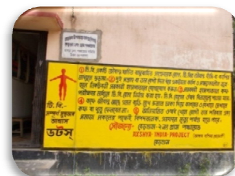
5. Wall writing at Bergoom No.2 GP.