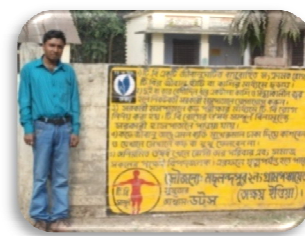
4. Wall writing at Maslandapur No. 2 GP.