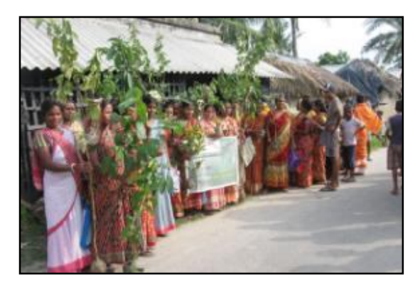
In pic: Sapling distribution amongst farmers and Students