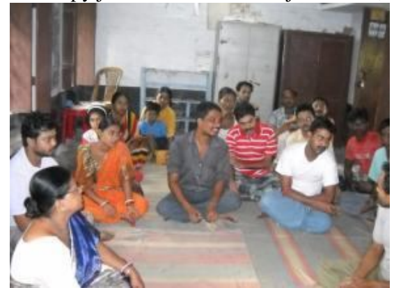
children; counseling - Once in a month